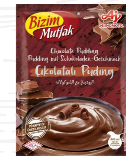
CHOCOLATE PUDDING 3000338 - 107 G