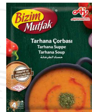
TARHANA SOUP 06417-05 - 65 G