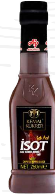
ISOT (CHIPOTLE) PEPPER SAUCE (VERY HOT) 1-20-24-20-021 - 250 ml - Glass bottle