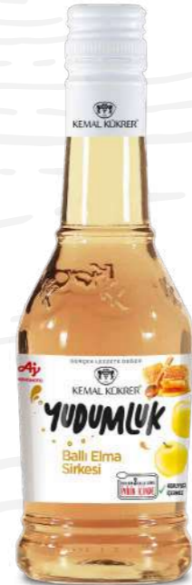
APPLE VINEGAR WITH HONEY 1-10-11-20-026 500 ml - Glass bottle