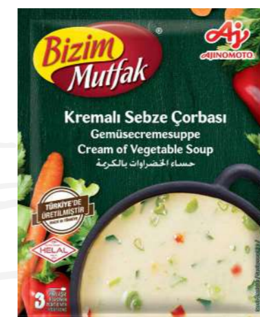
CREAM OF VEGETABLE SOUP 3000424 - 45 G