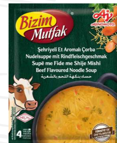
BEEF FLAVOURED NOODLE SOUP 06497-04 - 65 G