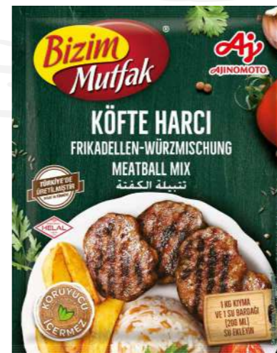
MEATBALL MIX 3000448 - 85 G