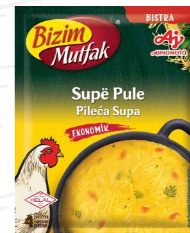
BALKAN CHICKEN FLAVOURED NOODLE SOUP 06461-02 - 40 G