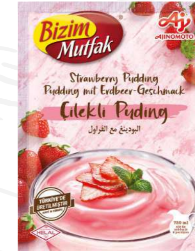
STRAWBERRY PUDDING 3000337 - 120 G