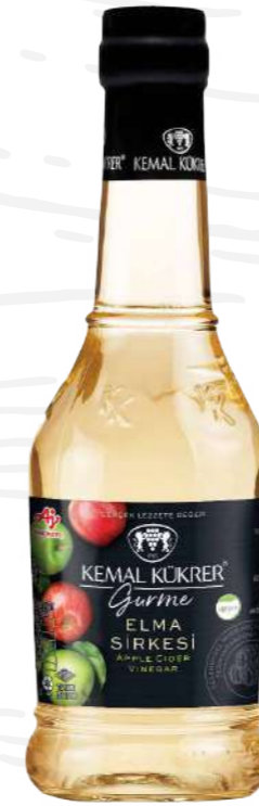
GOURMET APPLE VINEGAR 1-10-11-20-001 500 ml - Glass bottle