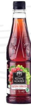
GRAPE VINEGAR 1-10-10-10-010 750 ml - Pet bottle