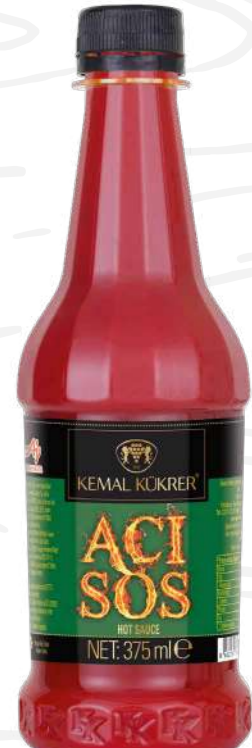
HOT SAUCE 1-20-18-10-001 375 ml - Pet bottle