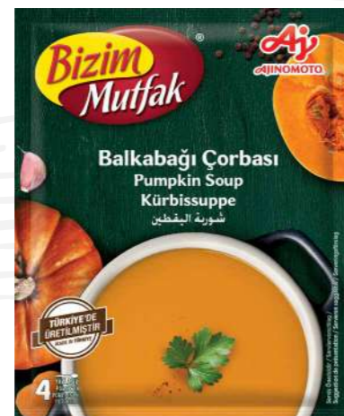
PUMPKIN SOUP 3000343 - 92 G