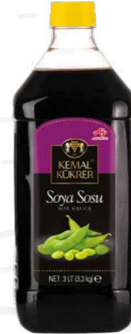
SOY SAUCE 1-20-15-10-040 3 Lt - Pet bottle