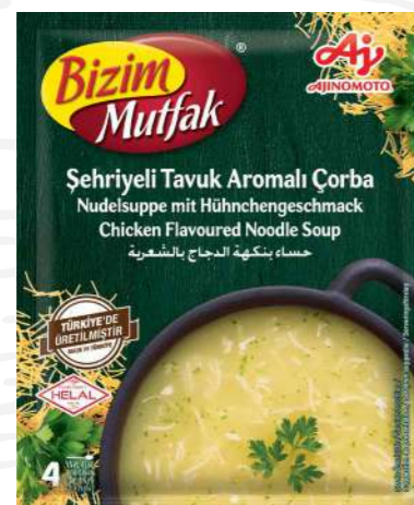
CHICKEN FLAVOURED NOODLE SOUP 06416-05 - 58 G