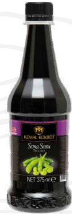
SOY SAUCE 1-20-15-10-006 375 ml - Pet bottle