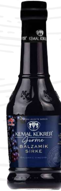
GOURMET BALSAMIC VINEGAR 1-10-12-20-001 500 ml - Glass bottle