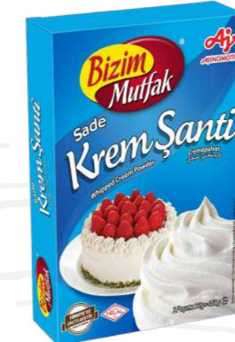
WHIPPED CREAM POWDER 150 G 06356-09