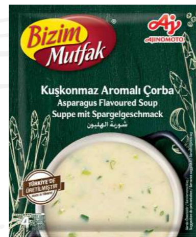
ASPARAGUS FLAVOURED SOUP 3000344 - 82 G