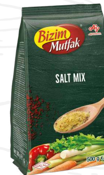
SALT MIX WITH DRIED VEGETABLES AND HERBS 06429-05 - 500 G