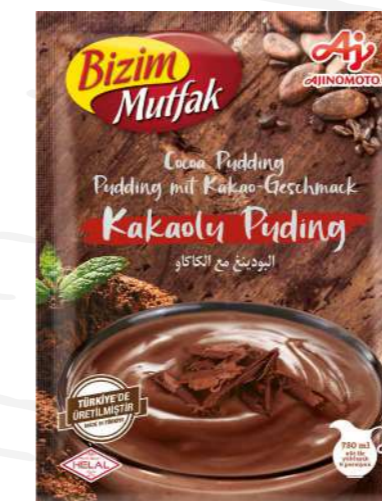
COCOA PUDDING 3000334 - 143 G