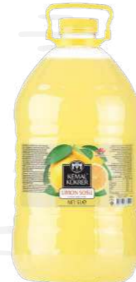
LEMON SAUCE 1-20-10-10-030 5 Lt - Pet bottle