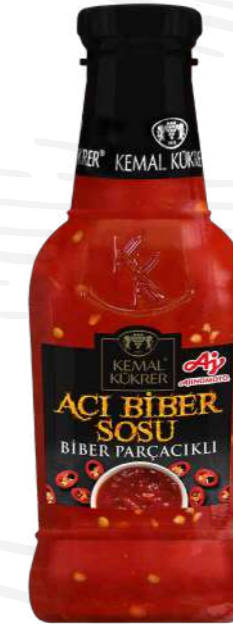
HOT SAUCE WITH PEPPER PARTICLES 1-20-17-20-012 - 250 ml - Pet bottle