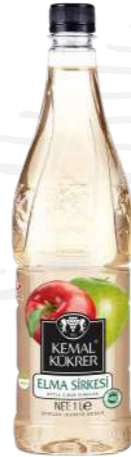
APPLE VINEGAR 1-10-11-10-023 1 Lt - Pet bottle