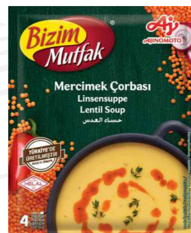
LENTIL SOUP 06417-03 - 65 G