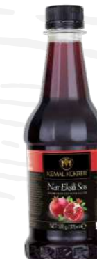
POMEGRANATE SOUR SAUCE 1-20-12-10-013 375 ml - Pet bottle