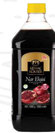
POMEGRANATE SOUR 1-20-11-10-050 3 Lt - Pet bottle