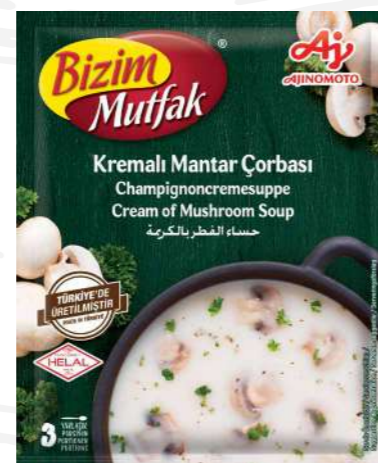
CREAM OF MUSHROOM SOUP 3000423 - 48 G