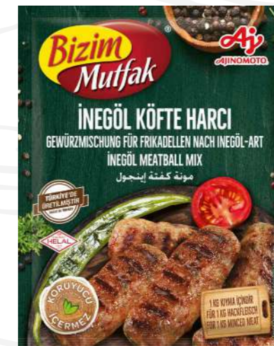
İNEGÖL MEATBALL MIX 06429-07 - 76 G