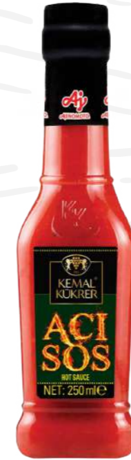
HOT SAUCE 1-20-18-20-017 250 ml - Glass bottle