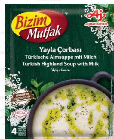
TURKISH HIGHLAND SOUP WITH MILK 06417-02 - 80 G