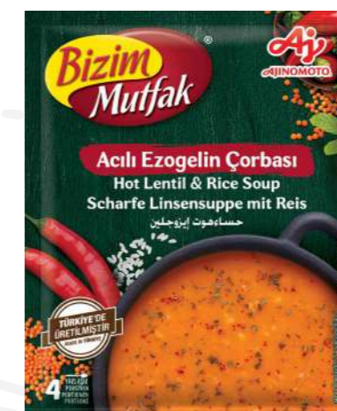
HOT LENTIL & RICE SOUP 3000328 - 79 G