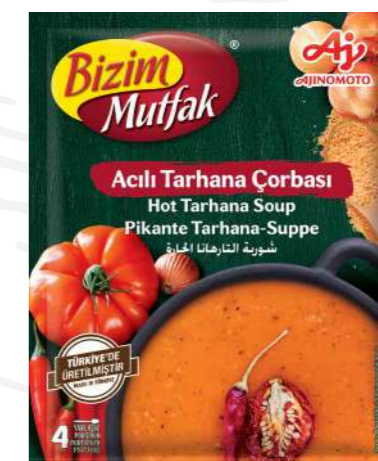
HOT TARHANA SOUP 3000356 - 65 G