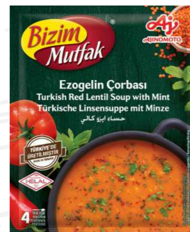
TURKISH RED LENTIL SOUP WITH MINT 06416-08 - 80 G