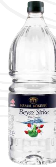
WHITE VINEGAR 1-10-17-10-007 2 Lt - Pet bottle