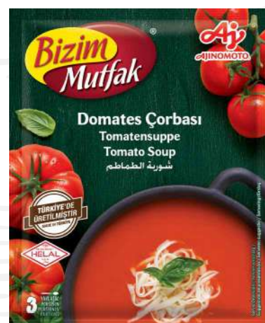
TOMATO SOUP 3000421 - 48 G