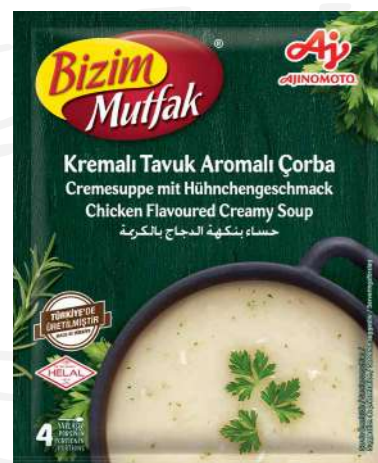
CHICKEN FLAVOURED CREAMY SOUP 06416-04 - 62 G