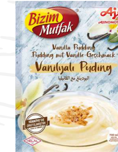
VANILLA PUDDING 3000336 - 120 G