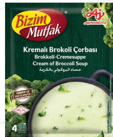
CREAM OF BROCCOLI SOUP 06324-08 - 75 G