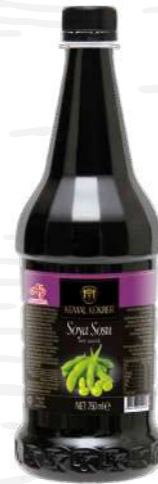
SOY SAUCE 1-20-15-10-010 750 ml - Pet bottle