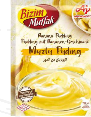
BANANA PUDDING 3000335 - 120 G