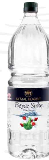
WHITE VINEGAR 1-10-17-10-001 1 Lt - Pet bottle