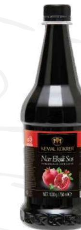
POMEGRANATE SOUR SAUCE 1-20-12-10-020 750 ml - Pet bottle