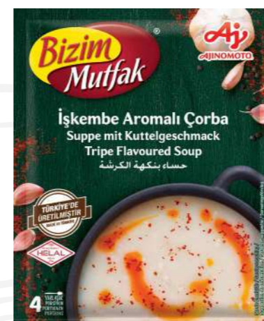
TRIPLE FLAVOURED SOUP 06417-04 - 65 G