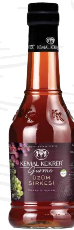
GOURMET GRAPE VINEGAR 1-10-10-20-001 500 ml - Glass bottle