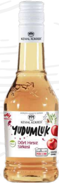
FOUR THIEVES VINEGAR 1-10-11-20-024 500 ml - Glass bottle