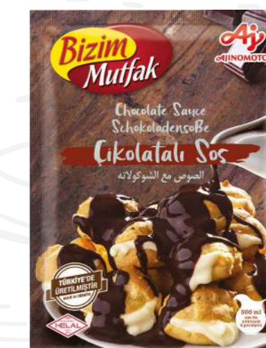
CHOCOLATE SAUCE 3000339 - 118 G