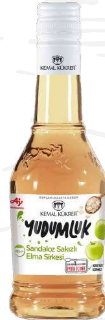
APPLE VINEGAR WITH SANDALOZ GUM 1-10-11-20-025 500 ml - Glass bottle