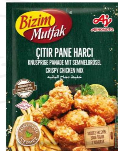
CRISPY CHICKEN MIX 06429-08 - 90 G