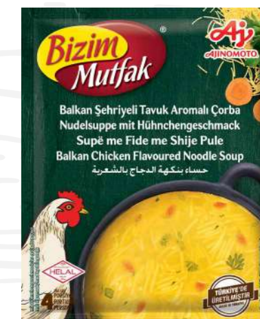
BALKAN CHICKEN FLAVOURED NOODLE SOUP 06499-09 - 62 G